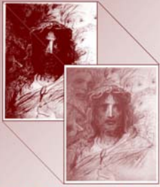
A Lenten-Easter Journey to Blessedness

The pictures above highlight the difference—where the picture in the foreground is a “first generation” copy and the picture in the background is a copy of that copy (a “second generation” copy).