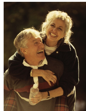
XYZs (Extra Years of Zest) are the 55+ group at SUMC.