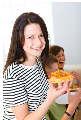
Breaking Bread Dinner Groups kick off after church on February 26.