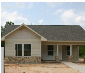
Our 2009 Habitat House as it neared completion.

Everyone is invited to come to the Activity Center Wednesday, November 16 from 5:30 to 7 p.m. to enjoy a delicious fellowship supper and learn about our 2012 Habitat House. You'll get a sneak peek at the floor plan, elevation, and the construction schedule. Habitat folks will be on hand to talk about